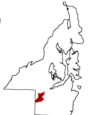
Figure 15-2 SKIA Comprehensive Plan Map