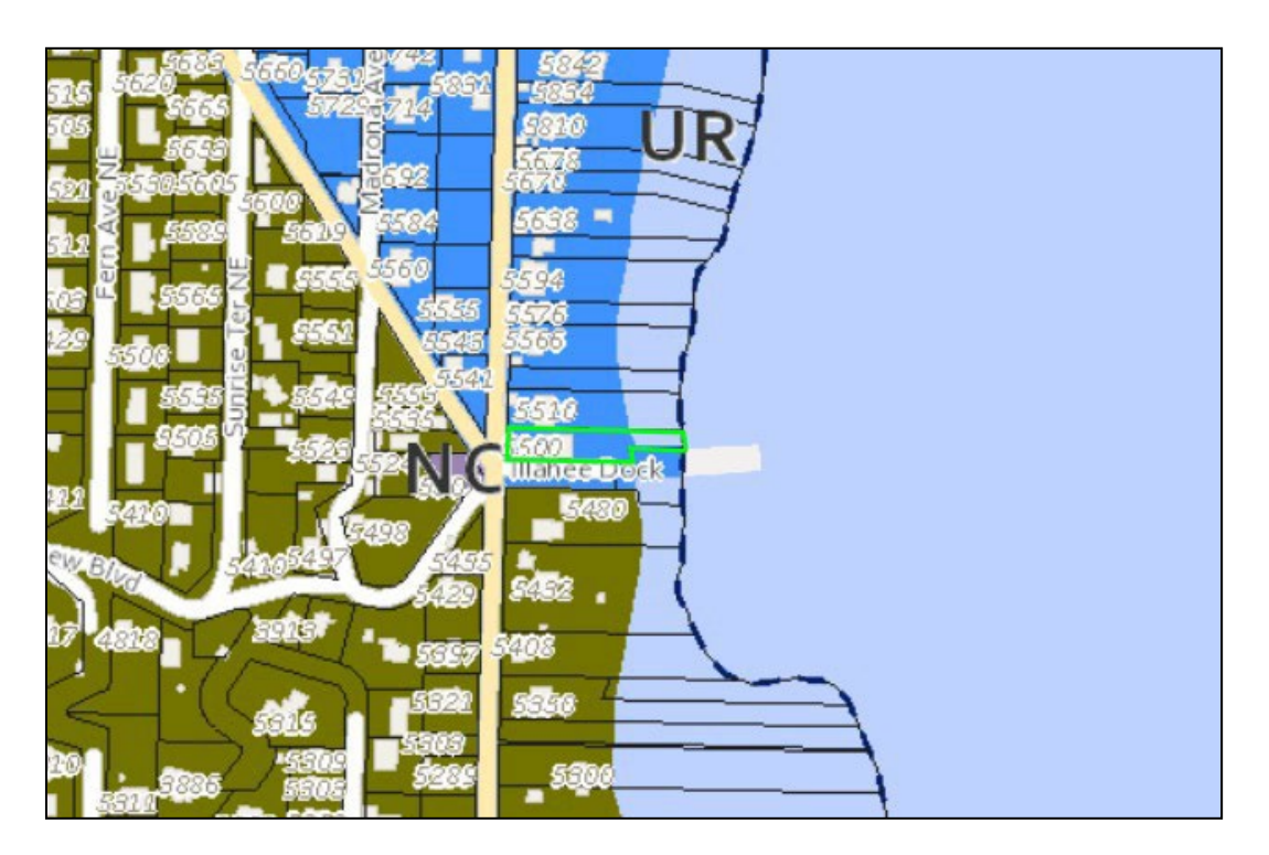
Attachment B – Critical Areas Map