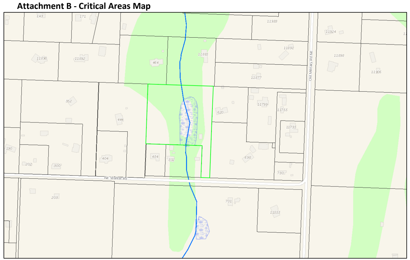
Mapped Critical Areas: Wetland, Type F Stream, Potential Wetlands