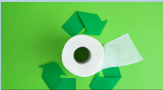
Recycled toilet paper dissolves quickly and is recommended for sewer and septic systems