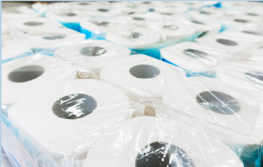
U.S. consumers use a fifth of the world's toilet paper but only account for 4% of population

Kitsap County Public Works | Sewer Utility