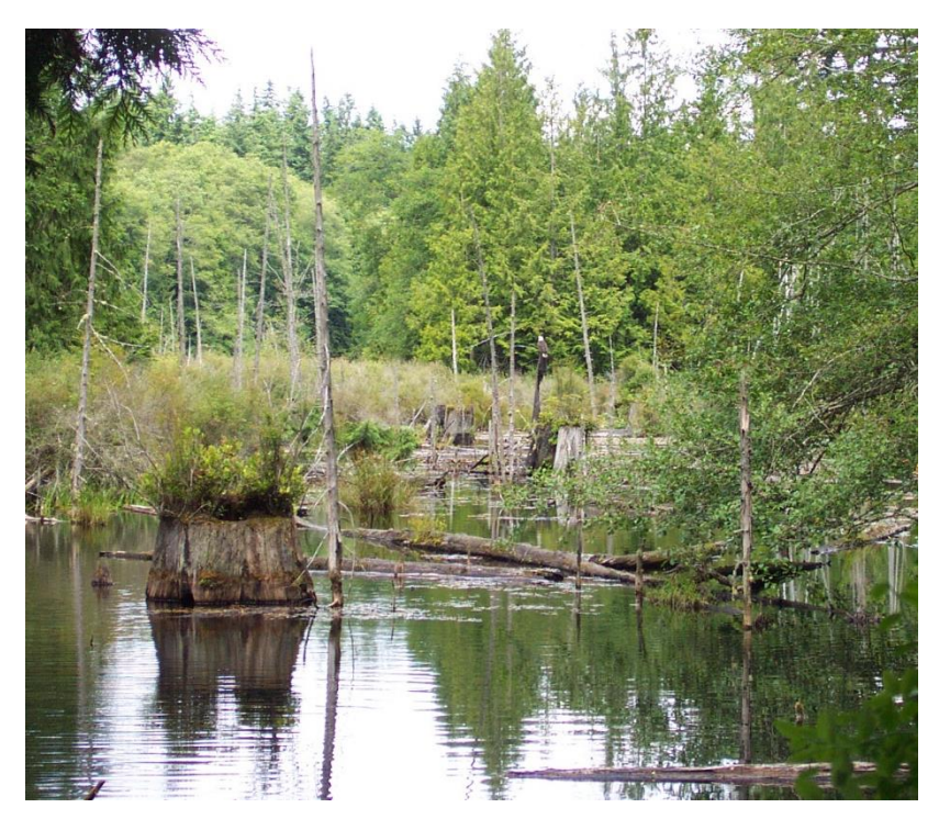
Eagle perched above the water on the Hawk's Ponds property.

Great Peninsula Conservancy, the Hansville Greenway Association, and Kitsap County Parks Department have an exciting opportunity to acquire a beautiful 10-acre parcel on the shores of two ponds and expand the Hansville Greenway. The Hawk's Ponds property is an undeveloped piece of land that spans the upland forest between Upper Hawk's Pond and Lower Hawk's Pond. Both northern and southern boundaries connect to existing Hansville Greenway property. The wetland and forest habitats support black bears, beavers, river otter, eagles, ospreys, fish, and amphibians.