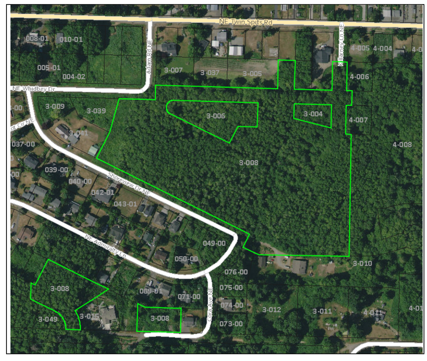
This is not a survey. It is provided as a convenience to locate the land indicated hereon with reference to streets and other land. It is not intended to show all matters related to the property including, but not limited to, areas, dimensions, assessments, encroachments, or location boundaries. It is not a part of, nor does it modify the commitment or policy to which it is attached. The company assumes no liability for any matter related to this sketch. Reference should be made to an accurate survey for further information.