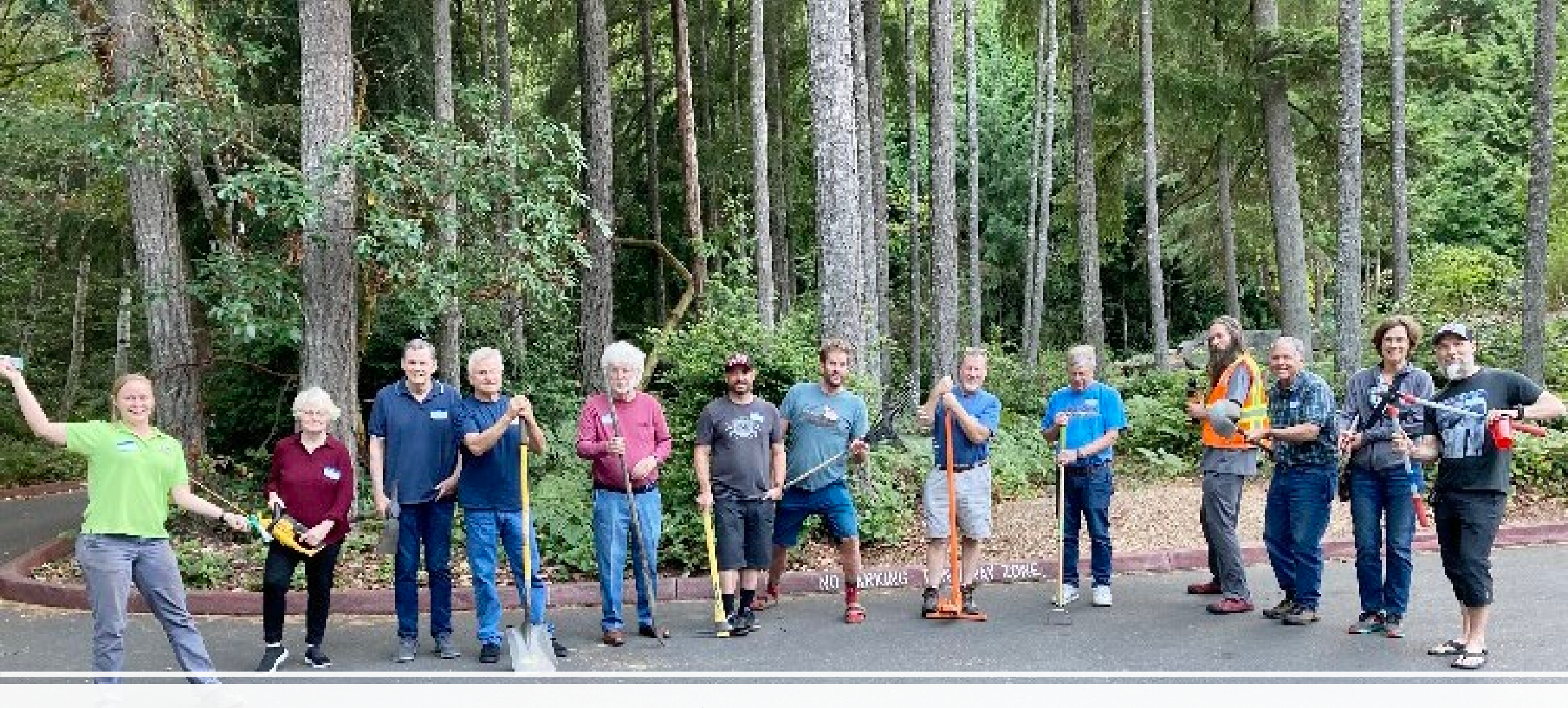
Lead Volunteer Training