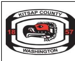
EXHIBIT F CONTRACT FOR GOODS AND SERVICES

Purchasing Department 619 Division St., MS-7 Port Orchard, WA 98366 Phone: (360) 337-4789 Purchasing@co.kitsap.wa.us