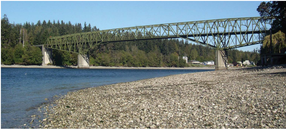
Agate Pass Bridge