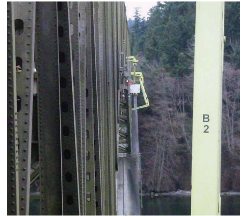
Crews will use Under-Bridge-Inspection Trucks (UBITs) to clean, inspect and maintain the Agate Pass Bridge in February 2018.

accumulations of debris by hand, followed by a low-pressure water flush.