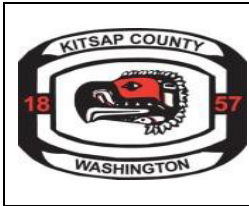
EXHIBIT B COST PROPOSAL FORM

PURCHASING DEPARTMENT 619 DIVISION ST., MS-7 PORT ORCHARD, WA 98366 PHONE: (360) 337-4789 PURCHASING@KITSAP.GOV